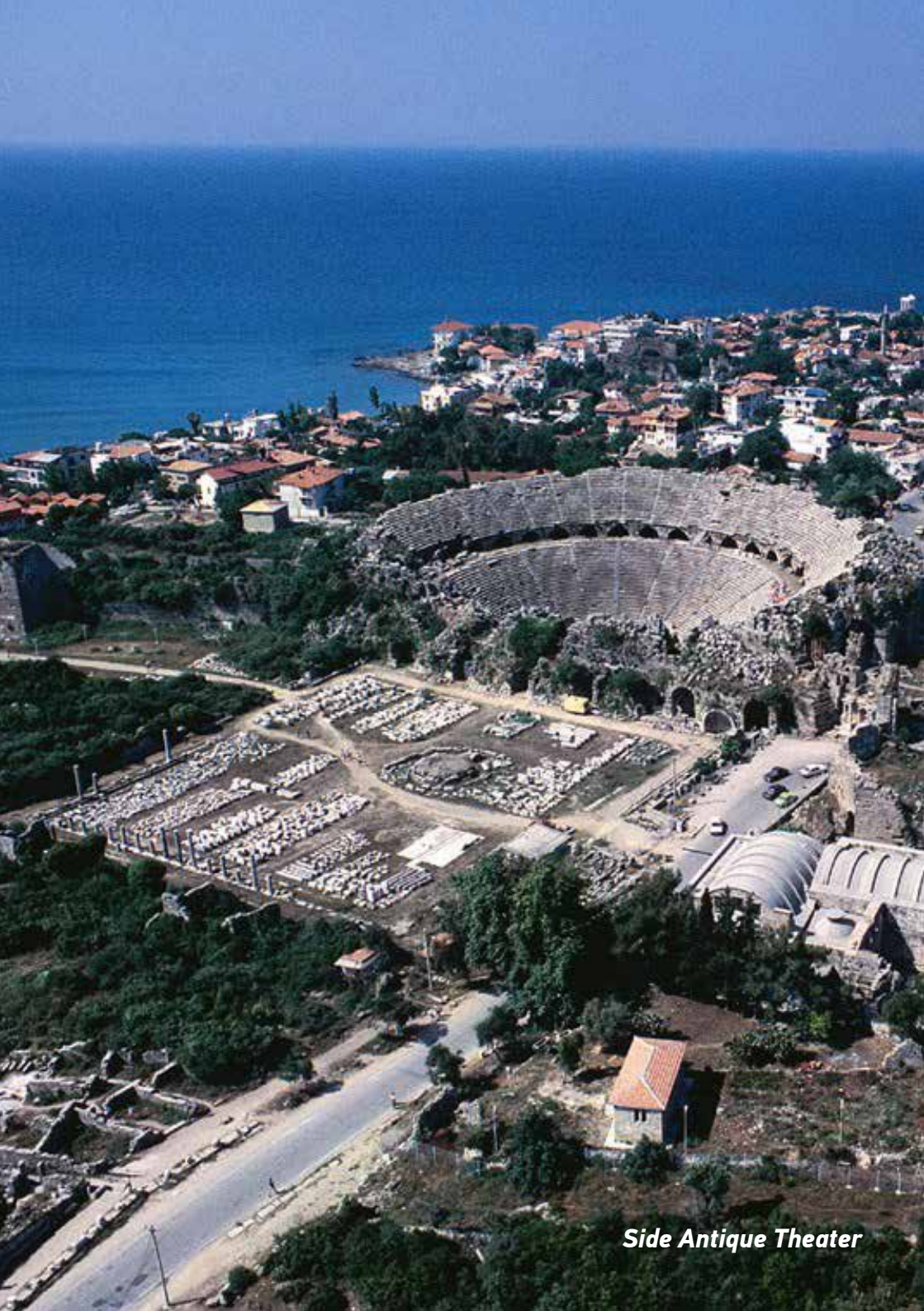
Side Antique Theater