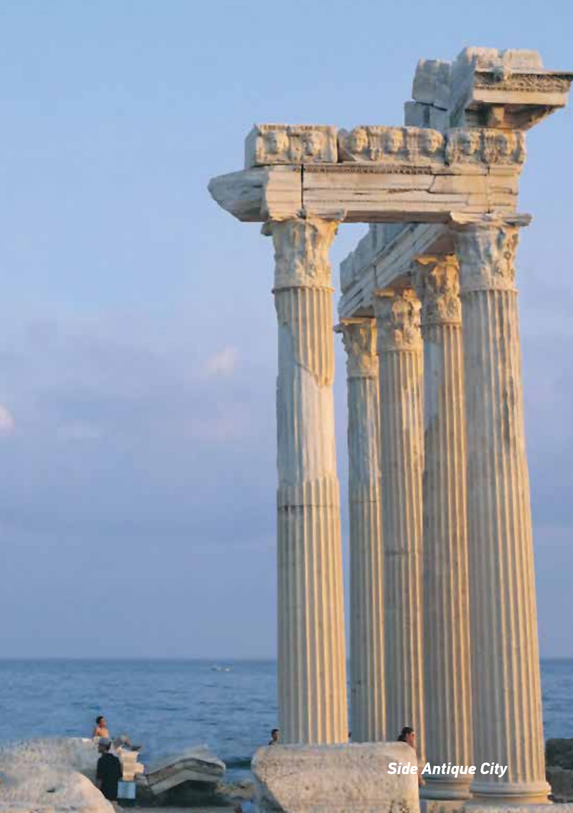
Side Antique City